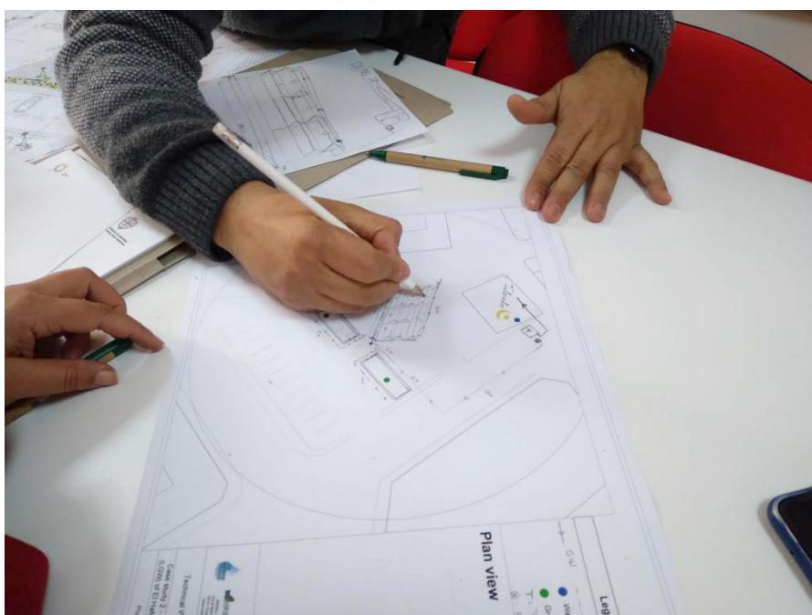
Training in Tunisia