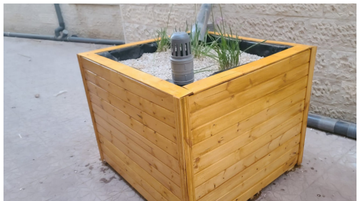
Rain Garden Jerash, Jordan