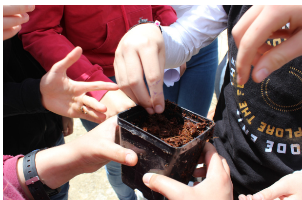
School Camp children Sicily, Italy

Shot in Italian and subtitled in English, French, Arabic, Spanish, Catalan and Greek, the short film is a candidate for numerous international film festivals and has already been selected by fifteen of them, winning the audience award (12–17 years old) at one of them.