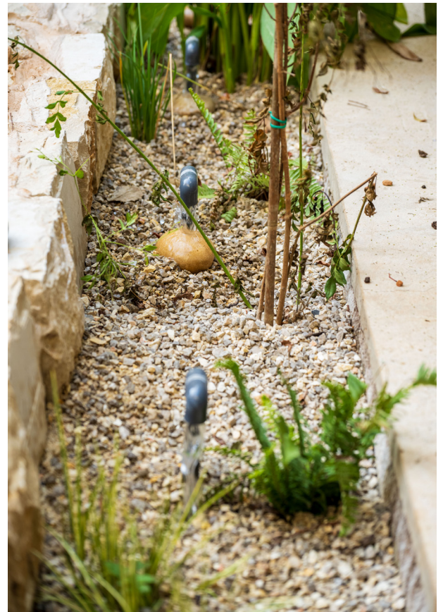
Green Façade, Lebanon