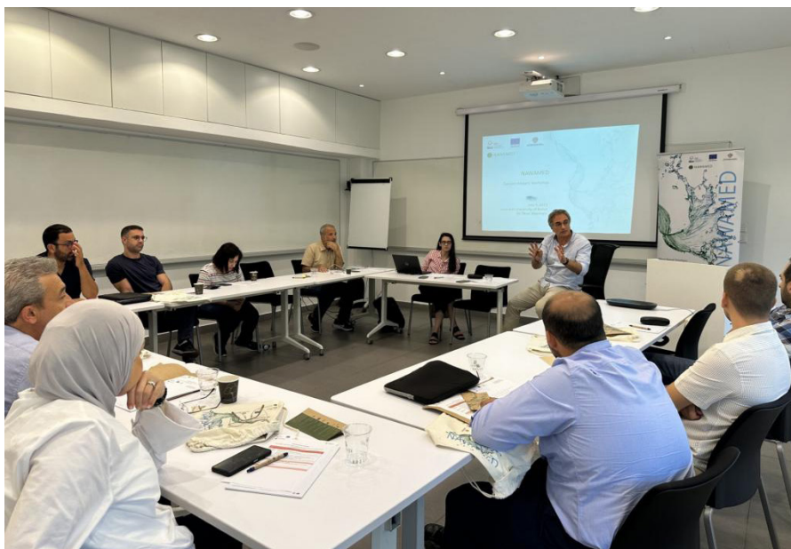
Workshop in Lebanon

(iii) the determination of quality standards for reclaimed water for use in the urban environment, to provide quality targets to technology providers,