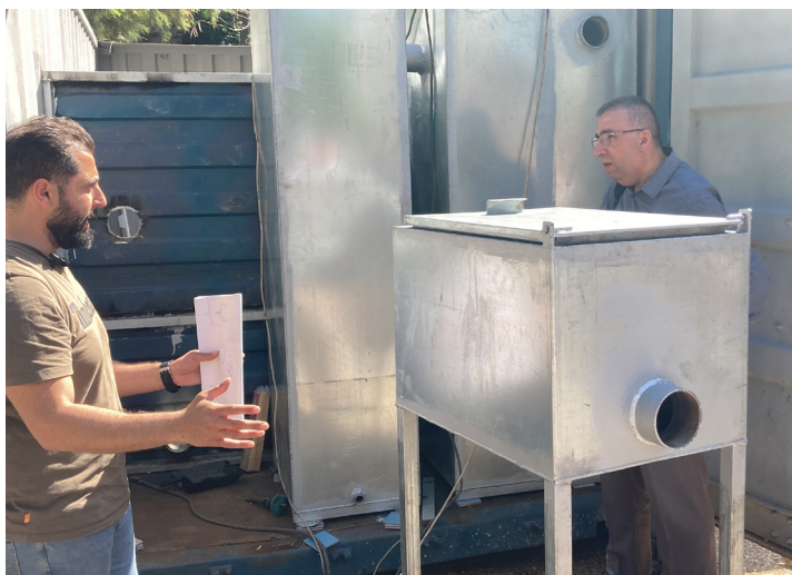
Work in progress: portable CW system, Lebanon