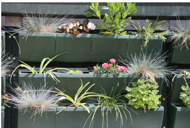
Pots Green Wall, Tunisia

A public school in Ferla (Sicily -Italy) and in 2 student dormitories at the university campus in Tunis (Tunisia) and in Beirut (Lebanon).