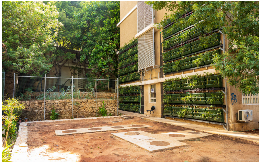
Green Walls, Lebanon

The possibility of treating greywater with natural techniques is well known. In urban contexts, natural solutions developed vertically can be proposed, recovering walls not in use, thus contributing to achieving other objectives such as building aesthetics, cooling, etc. The plant species hosted by green walls promote bacterial biodiversity, guaranteeing purifying efficacy, as well as having aesthetic and cooling functions.