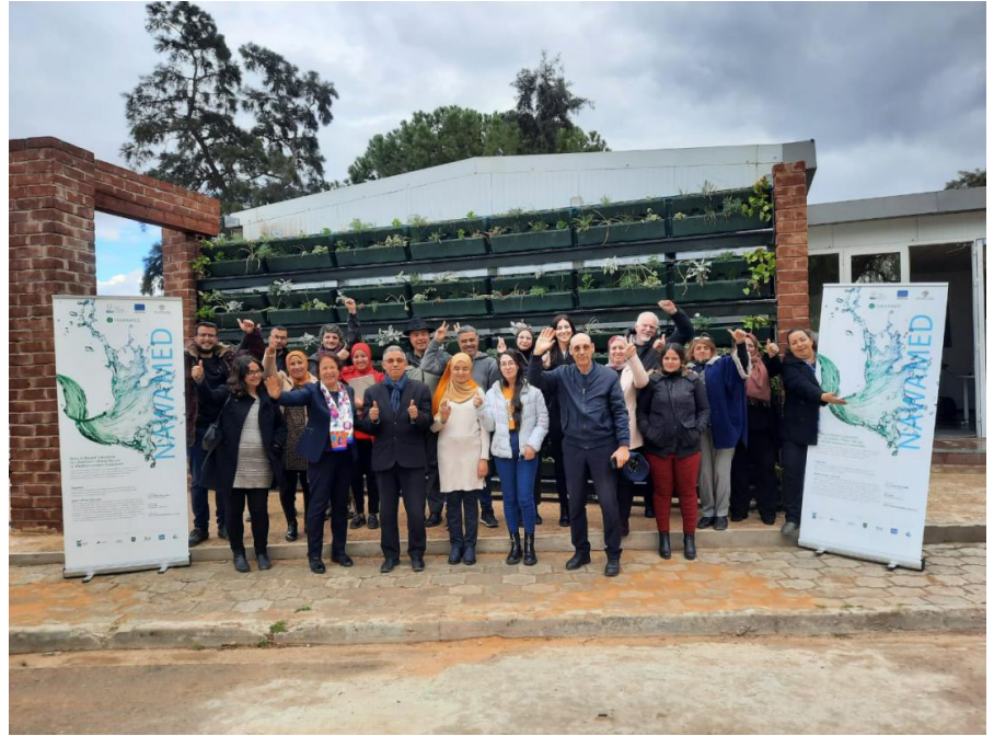
Training in Tunisia

The workshops, attended by more than 100 participants, promoted exchanges between different national actors and stakeholders in order to identify possible changes/amendments to local regulations and urban planning tools to encourage and promote the use of NCW in urban areas. The main issues discussed and classified as high impact level included the need to ensure greater transparency in the decision-making process - which ultimately requires the inclusion of public discussion and political debate between citizens and politicians, ensuring participatory planning as a crucial step and promoting responsible water use practices. The involvement and engagement of young people is crucial in creating a successful and effective integrated planning process for sustainable and equitable communities.