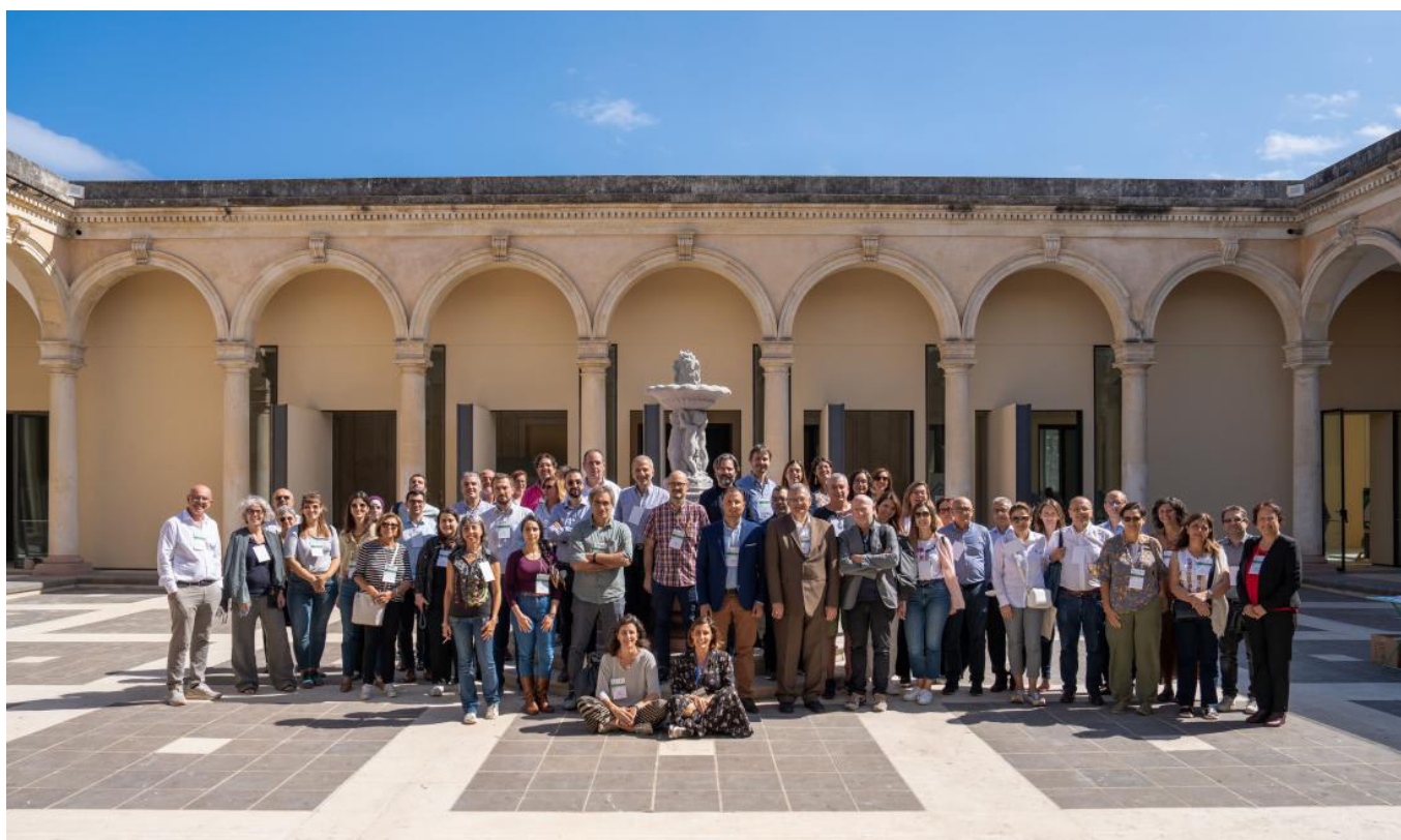
International Event Sicily, Italy