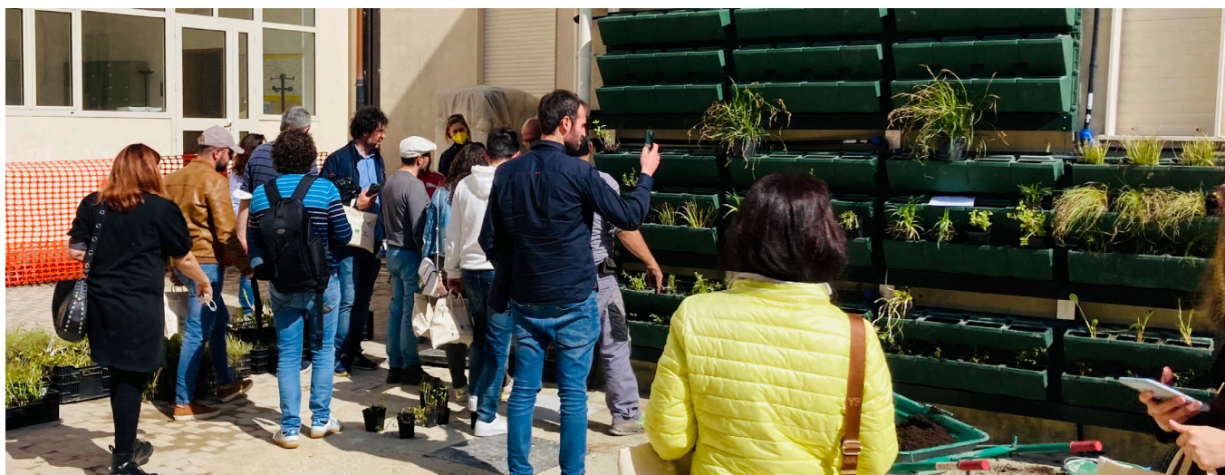
School Camp Sicily, Italy

training workshops on technical solutions for sustainable water management (SWM), technical visits to pilot plants and workshops on public policies to be adopted at local level to promote SWM solutions. These activities were developed in parallel with the school camps and the water table, where the individual aspects were deepened or expanded for the next level of discussion (i.e. the policy document).