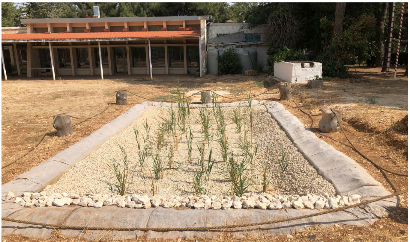
Constructed Wetland Beeka Valley, Lebanon