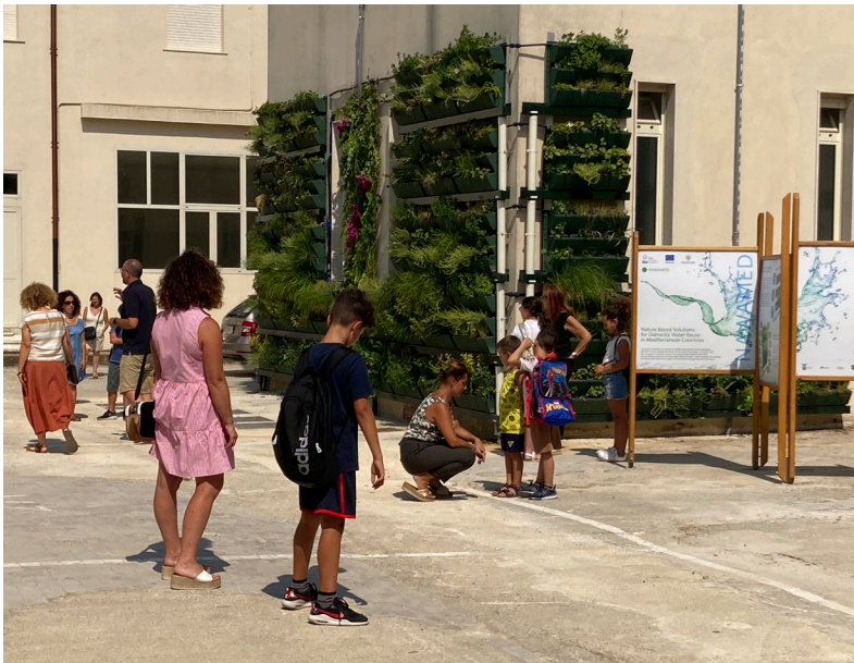
Green Wall, Italy