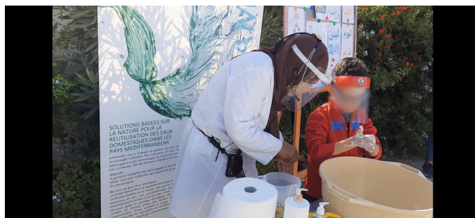
Activities with children, Tunisia

Furthermore, the synergy with the ENI CBC capitalisation project MEDWAYCAP made it possible to increase the participation of visitors to a travelling exhibition on NCWR and reuse at urban and agricultural level, installed in Sicily and Tunisia during the international events organised by NAWAMED.