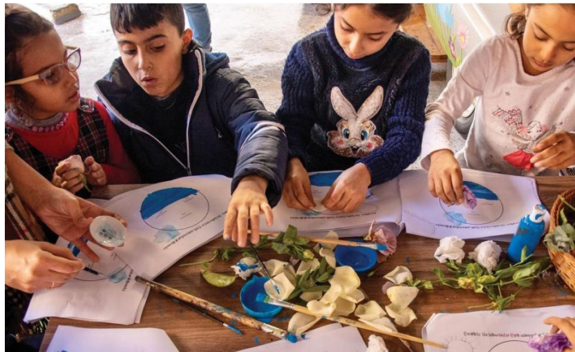
Activities with children, Lebanon

As a result, the partners developed different communication products aimed at two main target groups: technicians and decision-makers, and citizens and students.