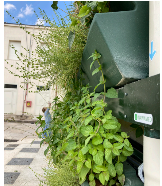
Green Wall, Italy