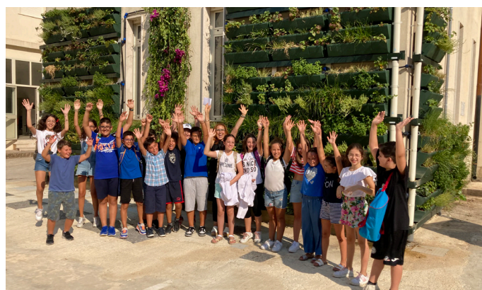
Activities with children Sicily, Italy

Finally, the partners developed awareness-raising campaigns directly involving schoolchildren and students, so that they could experiment for themselves what the protagonist of the short film does: a home-made system to understand that nature provides the solutions we sometimes seek, that it is up to us to see and appreciate them, and to experiment with solutions that benefit from the power of nature. NbS, such as our Green Walls.