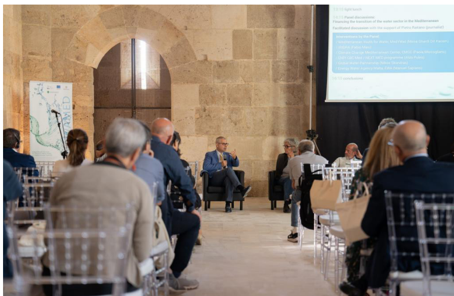
Mediterranean Water Table Sicily, Italy

Additionally, the different national stakeholder “water tables” provided a national perspective arising from the different participating countries, namely Tunisia, Italy, Lebanon, Jordan and Malta. The joint assessment of these different national perspectives, provided an opportunity to identify common challenges and opportunities leading to the formulation of a high-level regional policy document supporting the enabling of NCWR solutions in the Mediterranean region.