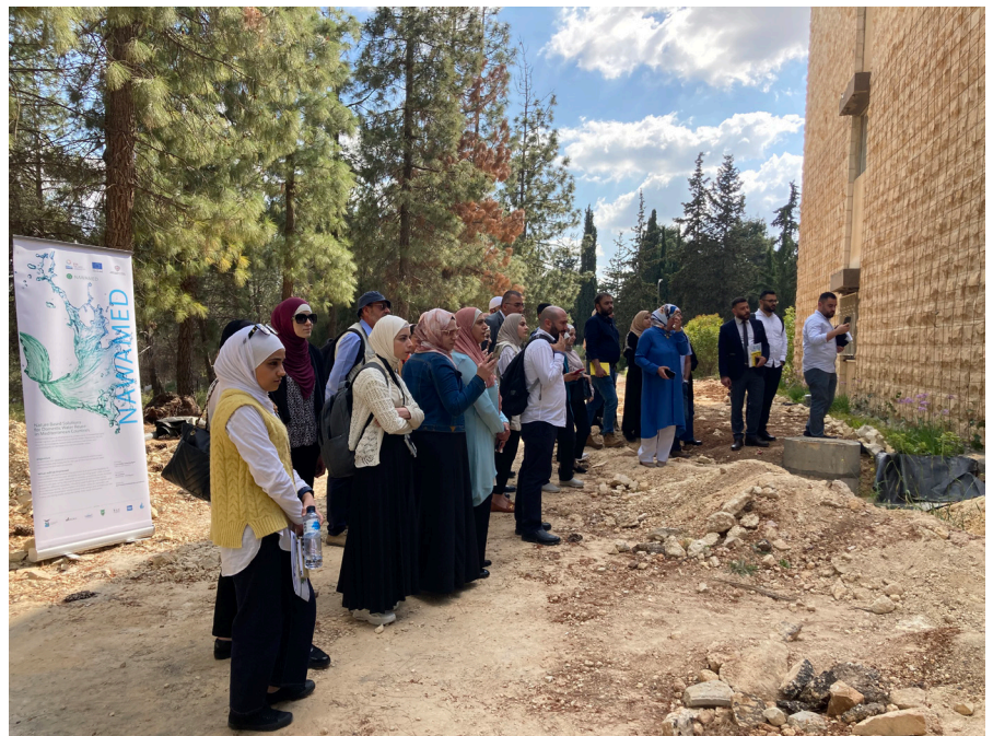
Training in Jordan