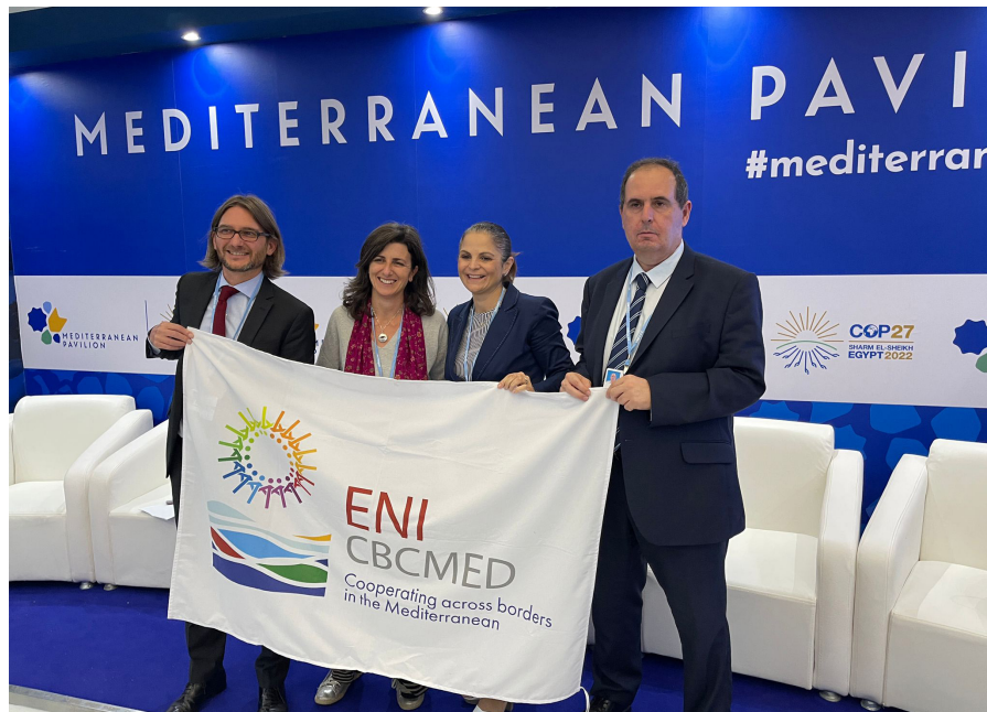
Nawamed presentation , COP27

From a policy perspective, NCWR solutions are considered as a central measure to address water supply security, by lowering the water demand of urban water consumption hotspots. NCWR applications provide an opportunity for increasing water use efficiency within urban areas, providing additional external benefits such as the betterment of the urban environment. Clear policy direction is therefore warranted at the national and regional level to promote NCWR solutions and ensure the safe use of these solutions to address emerging challenges due to demographic, economic and climate change.