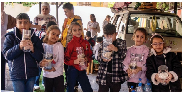
Activities with children, Lebanon

Under the leadership of NAWAMED, ENI CBC Med's water projects - AQUACYCLE, MEDISS, MENAWARA, PROSIM - decided to celebrate World Water Day 2021 by sharing their stories and commitments around a key message: "the value of water is much more than its price". Thanks to the partnership between the ENI CBC Med programme and the Union for the Mediterranean (UfM), the Mediterranean campaign, with 17 videos and 10 posters, was highlighted in Corriere della Sera, Italy's most widely read newspaper.