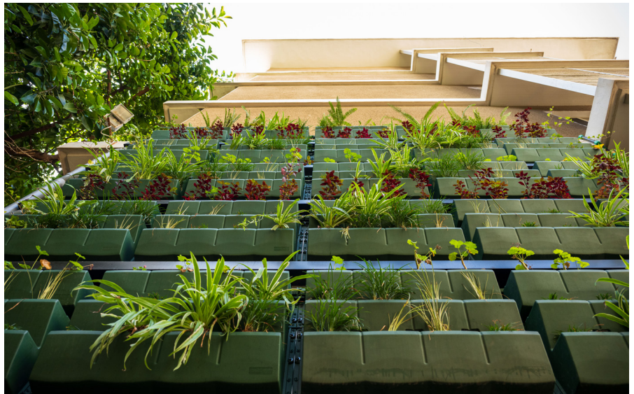
Green Wall, Lebanon

The safe reuse of greywater requires a decentralised treatment system. Greywater must be collected, treated and reused at the building scale , as the collection and treatment of greywater at the urban scale would require high investment and management costs. NbS are ideally suited to be used in a decentralised pattern: natural treatments systems – if correctly designed – work appropriately with little maintenance and don't require specialised management, on contrary of technology-intensive treatment systems. That's why NAWAMED focuses its attention on natural treatment technologies.