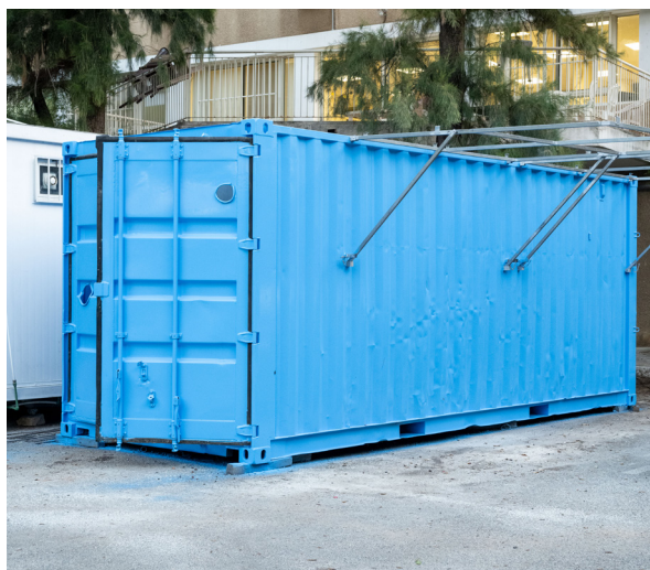
Portable unit, Lebanon

NAWAMED developed a portable unit in Lebanon for its use to ease water stress in emergency areas such as refugee camps.