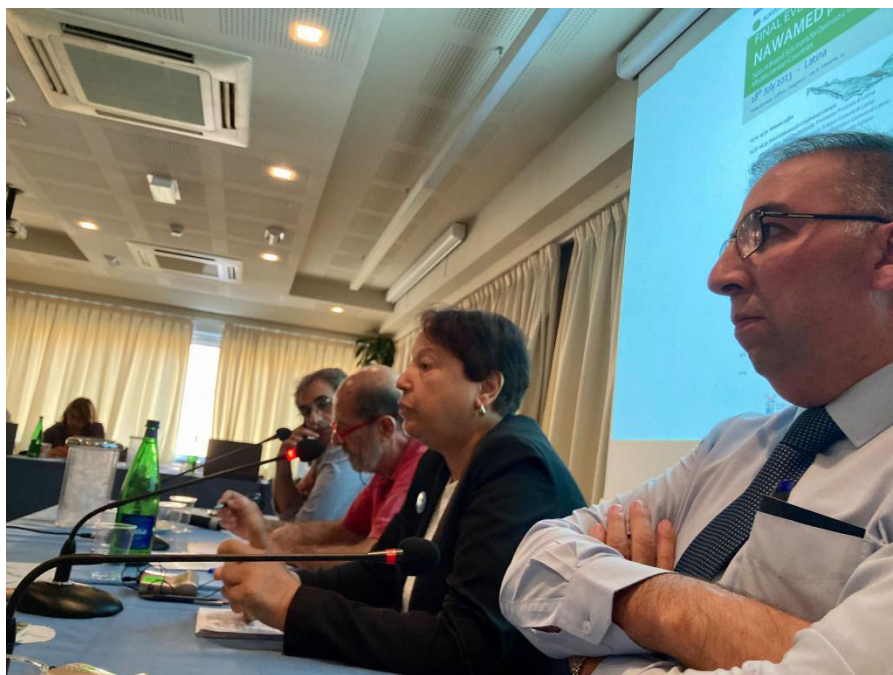
Final event Latina, Italy

By bringing together different stakeholders, the national “water tables” have provided a unique opportunity to comprehensively analyze the challenges related to the adoption of small-scale NCWR solutions in the urban environment. In fact, the “water-tables” brought together experts from the public sector (policy authorities, regulatory authorities and operators), the private sector, academia and voluntary organizations to openly debate and assess a common topic, that of facilitating the adoption of NCWR solutions.