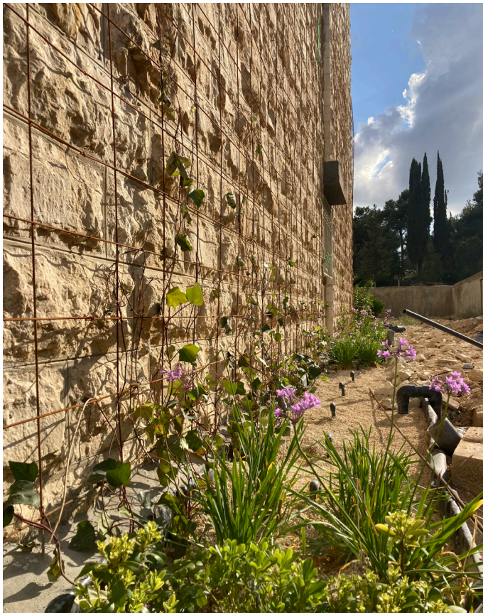
Green Façade, Jordan

Student dormitories at the university campus in Amman (Jordan) and in Beirut (Lebanon).