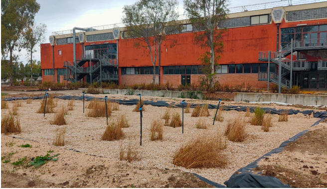
Constructed Wetland Latina, Italy