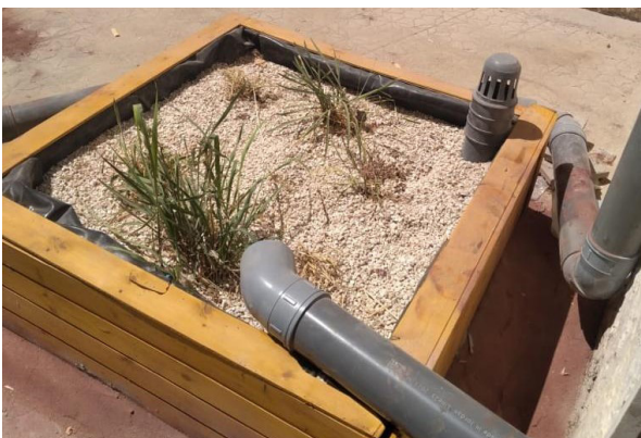
Rain Garden Jerash, Jordan