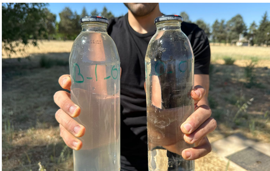
Students monitoring the quality of treated water, Lebanon

Training and capacity building activities are key phases in a pathway aimed at transferring the necessary know-how to local technicians and decision-makers in order to promote the dissemination and replication of the proposed solutions. NAWAMED began this process by identifying the key actors to be involved in the training and capacity building programme, following a first international e-technical workshop on “Designing urban nature-based solutions for greywater reuse”, thus actively involving multidisciplinary stakeholders at local level during: