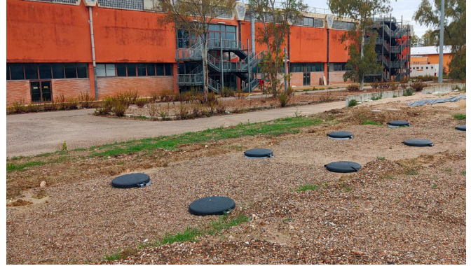
Constructed Wetland Latina, Italy

For the treatment of small volumes of stormwater, the so-called “ Rain Garden ” can be easily implemented. These systems are borrowed from the Vertical subsurface flow constructed wetland (VF) to treat rainwater from buildings’ roofs. They consist of sand filters planted with various types of plants that are characterized by their aesthetic and ornamental value and sustain the inclusion of these units in the green areas surrounding the buildings.