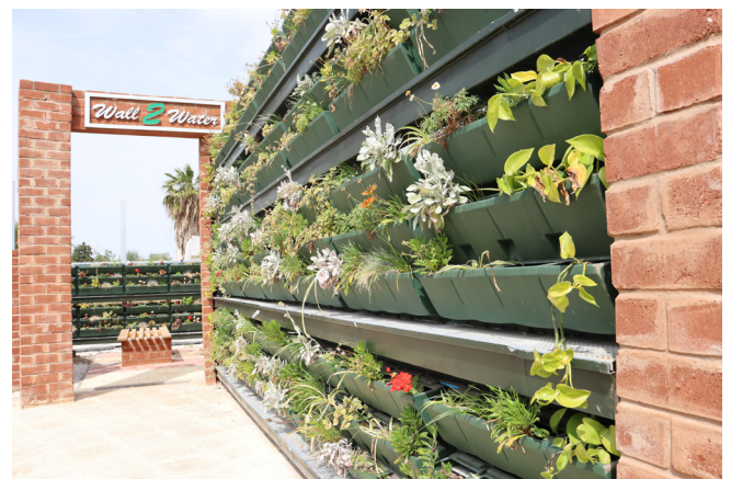
Green Wall, Tunisia