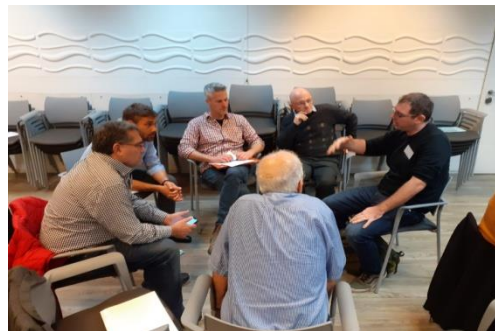
Three group sessions at work

Before the closing words , every group reported to the whole participants about the topics of the group discussion and the possible steps to be taken in order to make a progress.